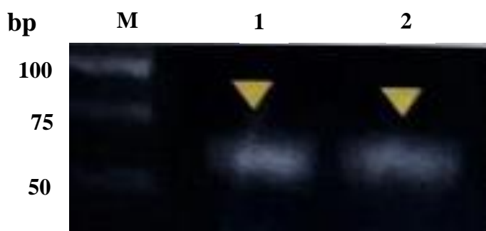
Figure 3. DNA amplification of histone fragments in gonggong snails hemolymph. M = Marker; 1 = hemolymph thick-shelled gonggong; 2 = hemolymph thin-shelled gonggong.

Figure 3 showed that the DNA of Bintan gonggong snails hemolymph is a histone fragment target of 75 bp. In mollusks there are H2A histone proteins (75 bp), which include 25 amino acids, \alpha -helix structures, and positively charged amino acids (arginine and lysine). They are as antimicrobial peptides. They are as candidate for natural antibiotics [4, 12].