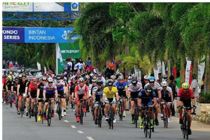
Figure 1. One of the international-based tourist events