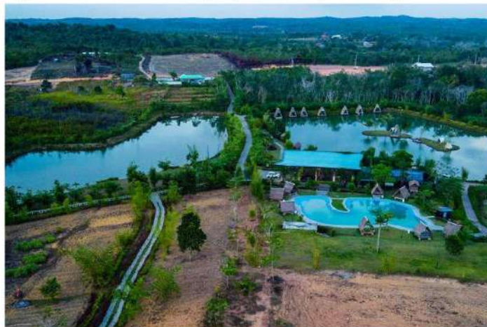
Figure 3. Potential of tourism village by Anculai village community, Bintan district

things that indicate this include the limited understanding of the community towards tourism and tourism awareness (including sapta charm) which results in attitudes and behavior of people who do not care about tourism. This can be seen in the attitudes and behavior of people who are offensive / aggressive towards tourists in offering products and services, the ODTW environment is dirty, unorganized, and does not provide a comfortable atmosphere for tourists. In addition, support for incentives and facilities from both government and private institutions for people who are going to travel is still limited.