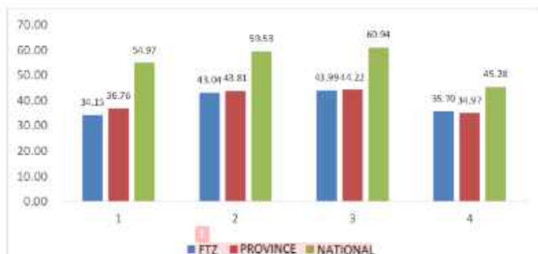
Figure 5. Comparison of mastery of Mathematics in the GCS for social science concentration

Comparison of the mathematics skills of the social science concentration students in the FTZ, as illustrated in Figure 5, indicates that the Free Trade Zones obtained higher GCS level than the regional level only for the fourth competency listed in the GCS, namely processing, presenting, and interpreting the data and understanding the rules of enumeration, permutations, combinations and probabilities and being able to apply them in solving problems (35.70%). Meanwhile, for the regional level, the percentage was 34.97%. However, GCS mastery in the FTZ and regional areas was far below the GCS at the National level.