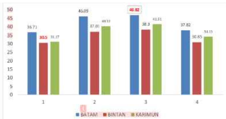
Figure 4. Achievement of Mathematics in the GCS of the social science concentration in the FTZ