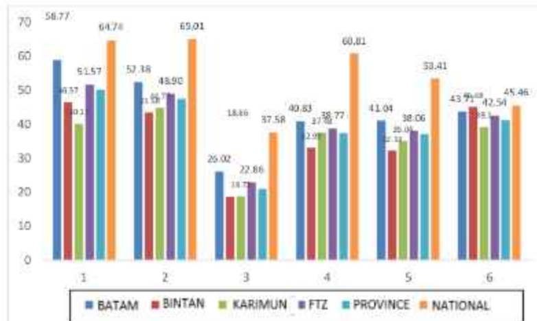
Figure 3. Comparison of senior high school GCS achievement of Natural Science concentration in the FTZ